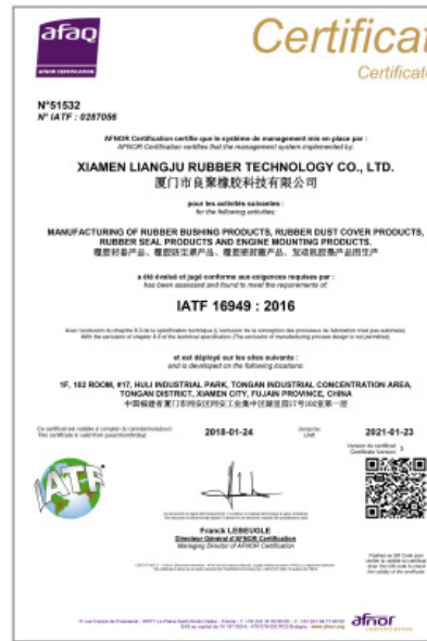
IATF 16949 : 2016