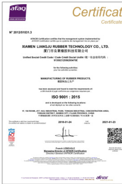
ISO 9001 : 2015